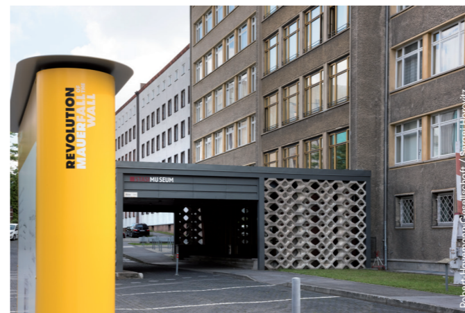
The Stasi Museum in the former offices of the Stasi minister Erich Mielke

The adjacent building still houses the Stasi archive. The Federal Commissioner for the Stasi Records offers guided tours of the archive and the Stasi complex. Dates can be found on the website www.bstu.bund.de .