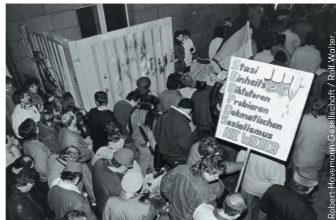
Occupying the Stasi headquarters, 15 January 1990