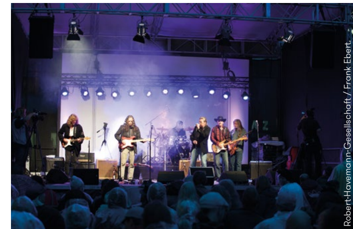
Monokel playing at Alexanderplatz, 2010