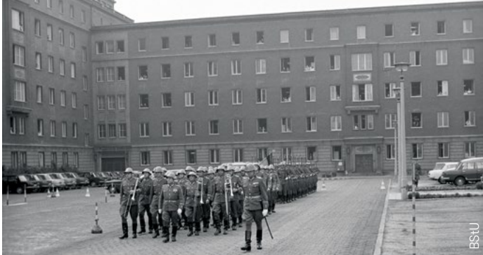
Stasi officers marching on the present-day exhibition area before the Wall fell

Archive tours offer insights into the inner workings of a secret police force that operated for forty years. The archive in Berlin houses some 43 kilometres of written documents and file cards, as well as a large collection of photo and audio materials, amassed at the headquarters of the Ministry of State Security.